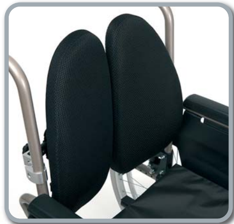
Angelwings backrest, providing comfort for specific needs for your back