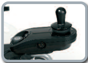
Easy and user-friendly controller