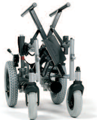
Very compact and foldable chair which facilitates transport