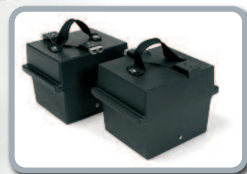
2 separate batteries