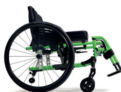
C85 Bright green