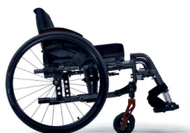
C86 Carbon grey

Unlock the opportunity to choose from a variety of hues, allowing you to personalize your wheelchair and truly embody your uniqueness.