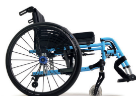
C79 Light blue